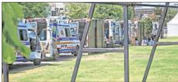
Ambulances wait outside the Dhanvantari Covid Care Hospital in Ahmedabad on Sunday.

The operations at the 900-bed facility, which was reviewed by Union Home Minister Amit Shah along with Chief Minister Vijay Rupani on April 23, was set to commence from Saturday. However, the facility deferred the process of admitting patients by a day due to glitches in the oxygen supply line, principal